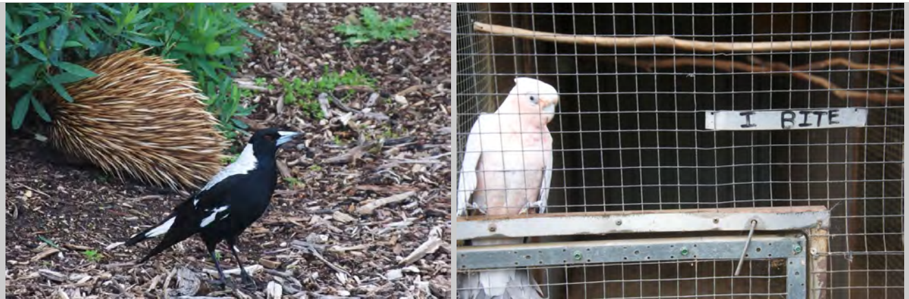
(left) The study group lounge may present some prickly issues for people that disagree (echidna not), but (right) hopefully you'll be warned ahead of time of the dangers.

We are still early in the planning process, but the study groups are already working hard to bring you the finest educational lounge experience in the southern hemisphere. We are talking poster tours, academic software demos, kiosk-style education clusters, hot topic debates, interactive discussions, and more. In true MR fashion, this lounge will be a great place to get excited and refocused! And, um, relaxed, and stuff.