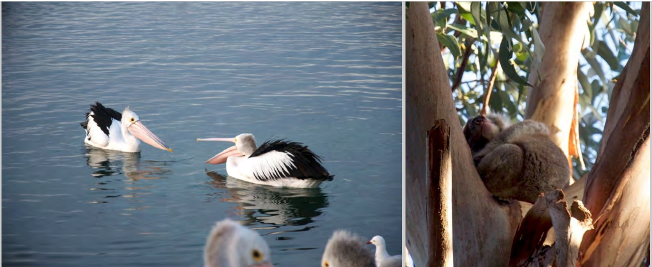
The study group lounge is a great place to (left) talk to friends and colleagues, or (right) just kick back after a long day of meetings. OK, that's not a bird, but she's chillaxin' like one.

We will be asking the study groups to make this a place that is really good for interacting with other folks that share a common interest. They may highlight posters from the meeting that are relevant to their study group, have poster walking tours (inside the lounge), showcase academic software, have a hot topic debate, etc. This will have a different feel than some of the previous study group meetings, however, in that there will be no traditional lectures. Hopefully, it will provide a refreshing break from the oral sessions that you attend, and be a chance for you to interact more with colleagues. This is yet one more change that we will poll you about after the meeting, to see if it worked well for you.