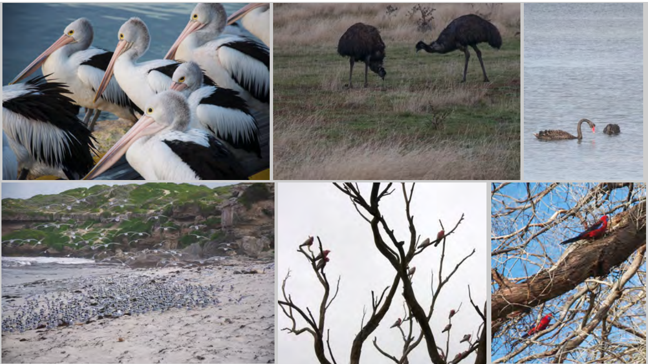
Supporting data for the “Birds of a Feather Flock Together” hypothesis.

The concept of the Study Group Lounge is intended to address the following comments I often hear: (1) the days are way too long, (2) the informal, one-on-one interactions that occur in the meeting are very important, and (3) there is not enough time to see the posters. We will be taking one of the rooms ordinarily used for oral sessions, converting it to the Study Group Lounge, and giving every study group - if they want - a slot during the day in which they can host the lounge. Groups may pair up together if they wish. An example of this is given in the layout below, same as in the SDU 4T blog, but now with the fifth column filled in.