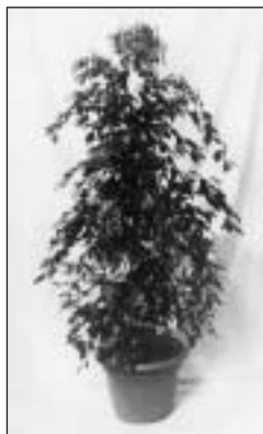
560401/560402/56408/560403 Ficus Benjamini, grün Ficus Benjaminie, green 150 cm, 180 cm, 200 cm, 250 cm