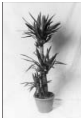
Auf Anfrage/on request Yucca-Palme Yucca palm ca./approx. 160 cm