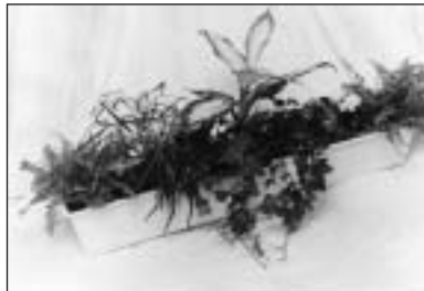
560300 Meterkasten, bepflanzt Container with plants