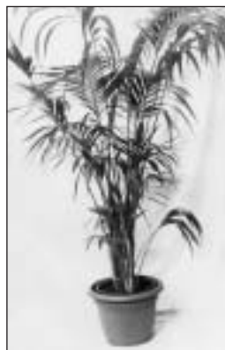
560404/560405/560407/560406 Kentia-Palme Kentia palm 150 cm, 180 cm, 200 cm, 250 cm