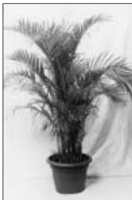
Auf Anfrage/on request Areca-Palme Areca palm