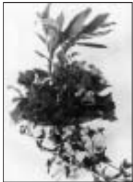
560201 Bodenschale nach Saison Bowl on floor/seasonal