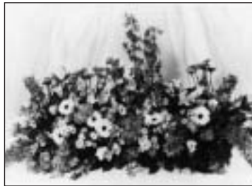
Nach Angebot/per quotation Gesteckte Blumenkante Mixed flower edge