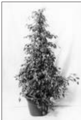
560401/560402/56408/560403 Ficus Benjamini, grün/weiß Ficus Benjaminie, green/white 150 cm, 180 cm, 200 cm, 250 cm