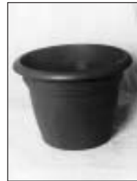
Auf Anfrage/on request Übertopf, terracottafarben Bowl, terra-cotta colour