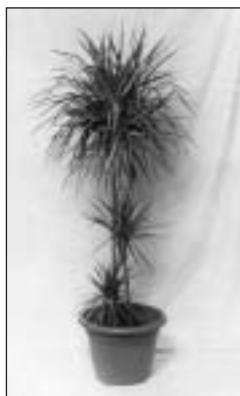
Auf Anfrage/on request Dracaena Dracaena