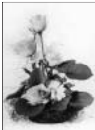
560101/560102/560103 Thekenschalen nach Saison Desktop bowl/seasonal