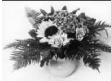
560105/560107/560108 Blumenstrauß nach Saison Bunch of flowers/seasonal