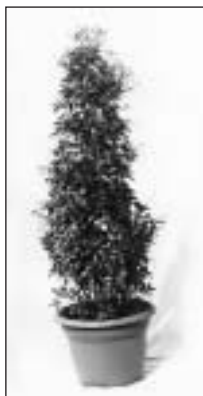
560070 Lorbeerpyramide Lauren pyramid ca./approx. 180 cm