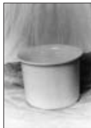
Auf Anfrage/on request Keramiktopf, weiß Pottery bowl, white