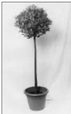
560071/560072 Lorbeerkugel Lauren globe 160 cm/180 cm