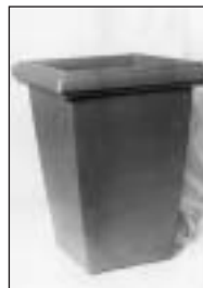
Auf Anfrage/on request Übertopf, terracottafarben Bowl, terra-cotta colour