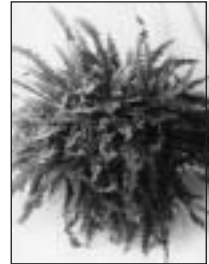
560060 Farn, Ø ca. 50 cm Fern, Ø approx. 50 cm