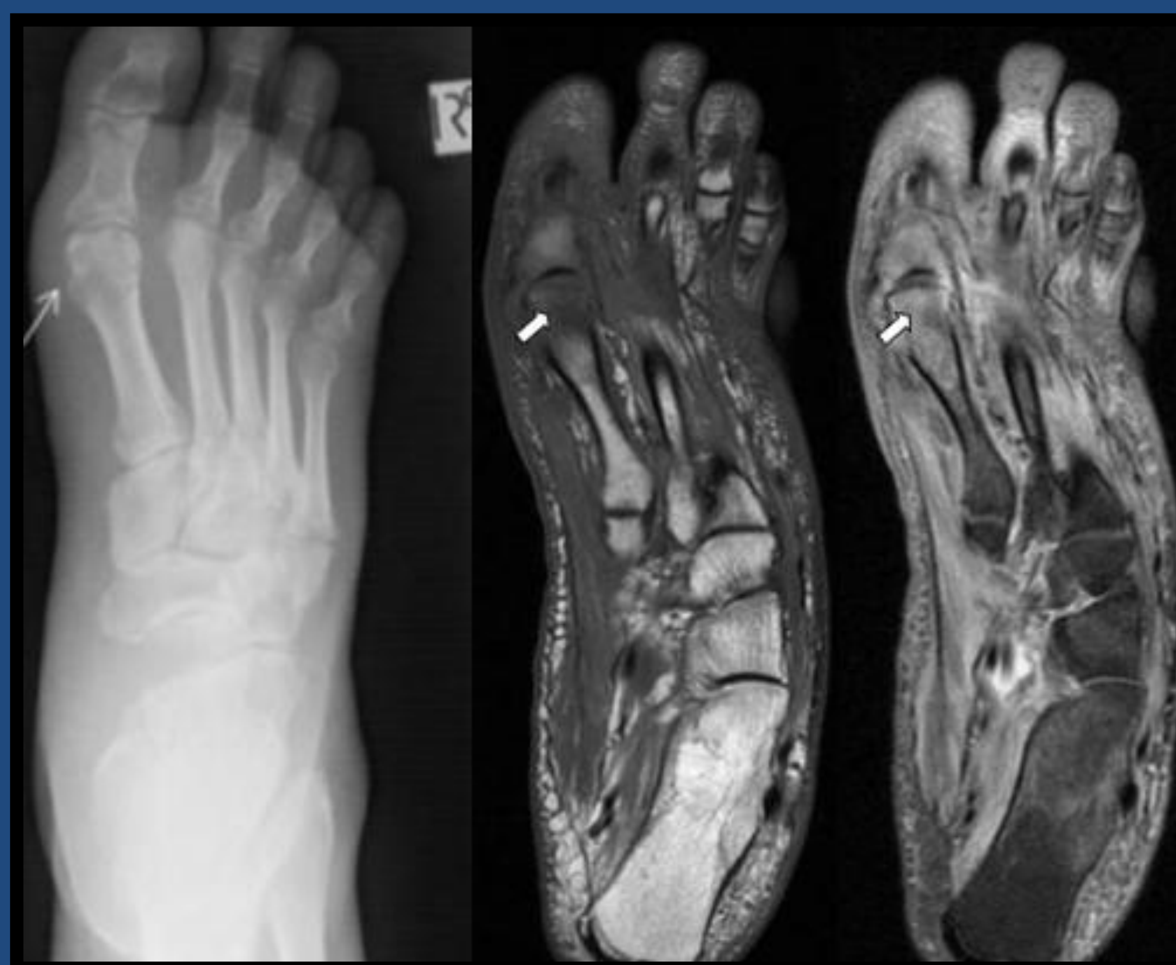
Figure 1 - (Left) AP view shows destructive process and osteolysis (white arrow). (Middle) Long axis T1-W; (Right) Long axis PDFS-W shows osteomyelitis characterised by low T1 and high PDFS signal intensity of marrow (white arrow).

MRI consistently confirmed the diagnosis of osteomyelitis in 100% of patients. Plain radiography however, was non-specific and insensitive in its diagnosis, demonstrating osteomyelitis definitively in only 21% of patients (Figure 1 and Graph 1).